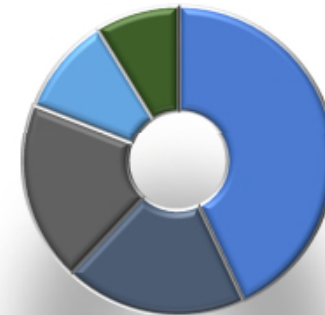
Top Five Losses - Greatest Incurred Cost