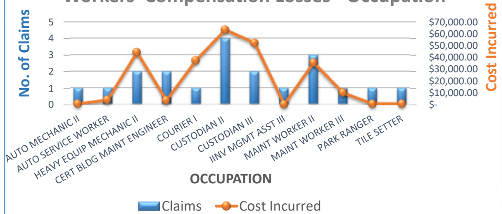
Workers' Compensation Losses - Occupation